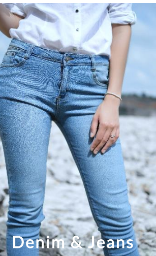
Denim & Jeans