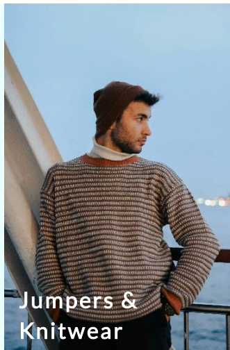
Jumpers & Knitwear