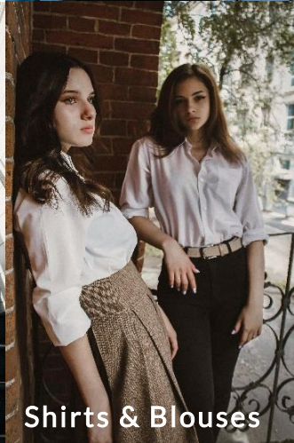
Shirts & Blouses