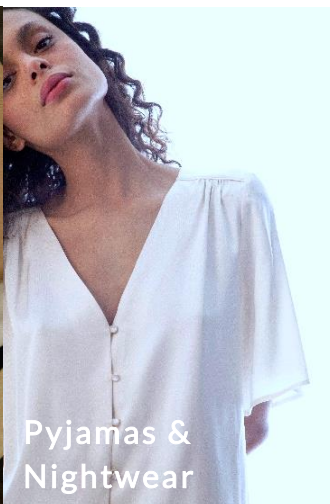
Pyjamas & Nightwear