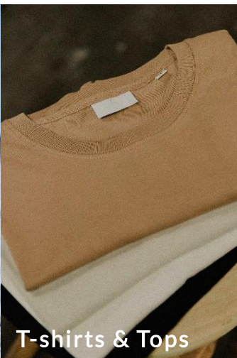
T-shirts & Tops